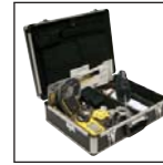
Confined space kit