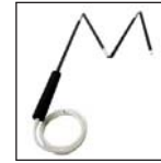
Collapsible sampling probe

For a complete list of accessories, please contact BW Technologies.