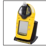
Integral pump and battery charger